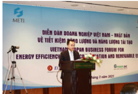
Vietnam-Japan Energy Conservation Forum