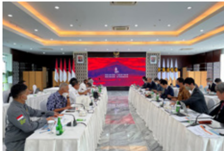
Joint public and private mission to Indonesia

JASE-W comprehensively and practically supports the development of energy-saving businesses of Japanese companies, such as dispatching member companies on missions, holding business forums in target countries and participating in international energy exhibitions.