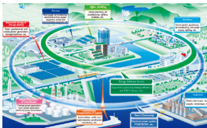
Conceptual map and classifications