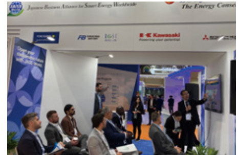
World Future Energy Summit (Exhibition)